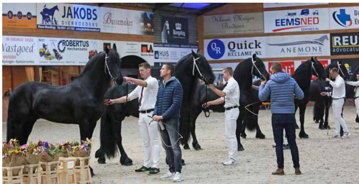
In 2021 six stallions were registered in the Studbook register.